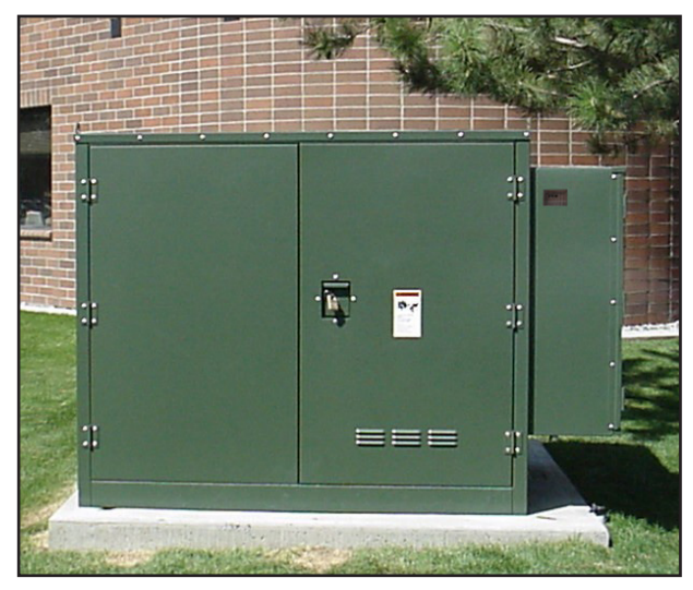
Automated switch for closed loop military system.

Due to the size of the project and the aggressive timetable, construction was implemented in phases. The first phase involved dividing most of the base into four radial loop systems each incorporating 5-7 automated switches being fed from the existing substation. Future phases would require additional automated switches and a new substation.