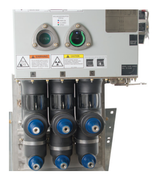
Trident-SR Switchgear with SafeVu Available up to 15.5kV

*Trident Switchgear Series can be designed for various solutions. See your sales representative for the various configurations.