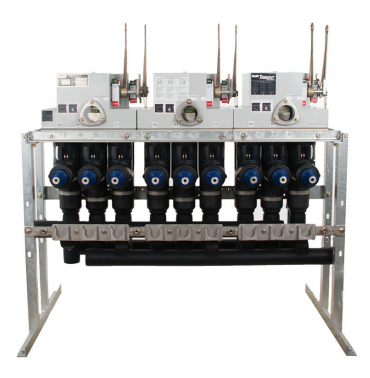
Trident-S Switchgear with SafeVu Available up to 29.3kV