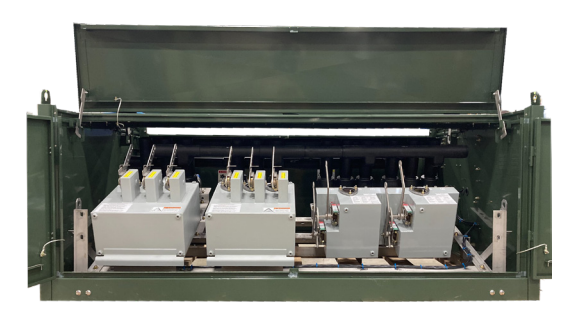
Low-profile Trident Switchgear Offers a lower profile mounting frame for Trident Switchgear-S w/ SafeVu and Trident-ST Switchgear