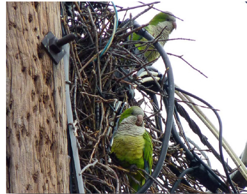
Monk parakeet nest

For G&W Electric, a major investor-owned utility customer in the Northeast was experiencing significant problems with flashovers and outages due to these communal nests. In this instance, it was a critical application outside of a hospital where the existing reclosers were temporarily removed to prevent the nests from being built, thereby preventing any flashovers or outages. However, this only provided a short-term and less than ideal solution.